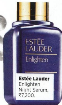
ESTÉE LAUDER Enlighten Estée Lauder Enlighten Night Serum, ₹7,200.