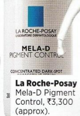
LA ROCHE-POSAY LABORATOIRE DERMATOLOGIQUE MELA-D PIGMENT CONTROL CONCENTRATED DARK SPOT La Roche-Posay Mela-D Pigment Control, ₹3,300 (approx).