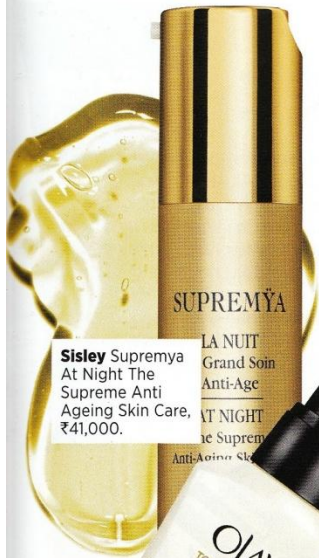
Sisley Supreme At Night The Supreme Anti Ageing Skin Care, ₹41,000.

Incorporate these skin-brightening serums in your daily care routine to address your dark worries. Flawless result assured for the bride-to-be as she can now gear up to sport a blemish-free and makeup-ready look.