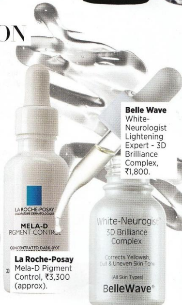
Belle Wave White- Neurologist Lightening Expert - 3D Brilliance Complex, ₹1,800.