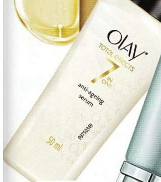
Olay Total Effects Anti- ageing Serum, ₹775.

LA NUIT Grand Soir Anti-Age AT NIGHT Supreme Anti-Ageing Skin