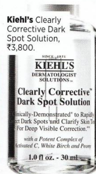
Kiehl's Clearly Corrective Dark Spot Solution, ₹3,800.

SINCE 1851 KIEHL'S DERMATOLOGIST SOLUTIONS™ Clearly Corrective® Dark Spot Solution Clinically-Demonstrated* to Rapidly Faint Dark Spots and Clarify Skin Tone For Deep Visible Correction. with a Potent Complex of Activated C, White Birch and Peon 1.0 fl. oz. - 30 ml