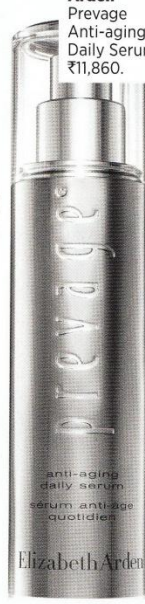
Elizabeth Arden Prevege Anti-aging Daily Serum, ₹11,860.