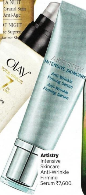
Artistry Intensive Skincare Anti-Wrinkle Firming Serum ₹7,600.