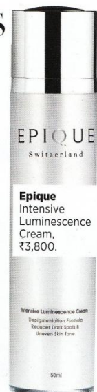
EPIQUE Switzerland Epique Intensive Luminescence Cream, ₹3,800.

SINCE 1851 KIEHL'S DERMATOLOGIST SOLUTIONS™ Clearly Corrective® Dark Spot Solution Clinically-Demonstrated* to Rapidly Faint Dark Spots and Clarify Skin Tone For Deep Visible Correction. with a Potent Complex of Activated C, White Birch and Peon 1.0 fl. oz. - 30 ml