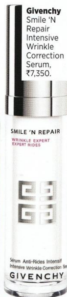
Givenchy Smile 'N' Repair Intensive Wrinkle Correction Serum, ₹7,350.