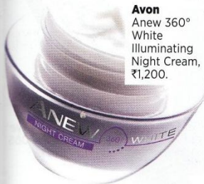
Avon Anew 360° White Illuminating Night Cream, ₹1,200.

Discolouration of skin can be tackled by skin-lightening products such as La Roche-Posay's Mela-D Pigment Control Concentrated Dark Spot Correcting Serum. It contains Kojic acid that erases dark patches. Studies have proven this serum corrects spots by 48 per cent within three months. The product significantly boosts skin radiance to look your best at the ceremonies.