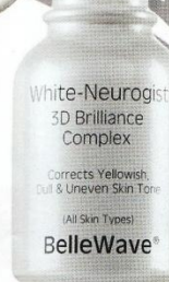
White-Neurologist 3D Brilliance Complex Corrects Yellowish, Dull & Uneven Skin Tone (All Skin Types) BelleWave®